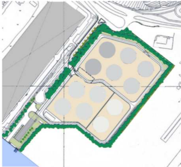
Landscape Master Plan (At Year 2040, with Residual Impacts)