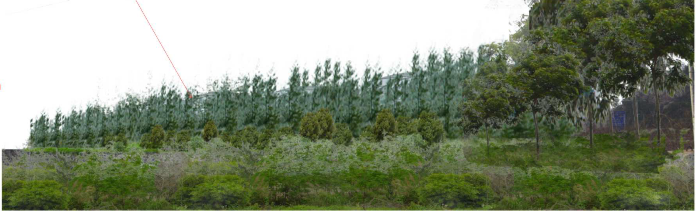
Photomontage of the proposed PAFF at Year 2040 showing Residual Impact (with mitigation measures and with full development of Phase 1 and Phase 2, from vpt.3.2 -SVR 3)

Mature Buffer Planting LMM2 (along site boundary by 2040 is predicted to fully screens tanks)